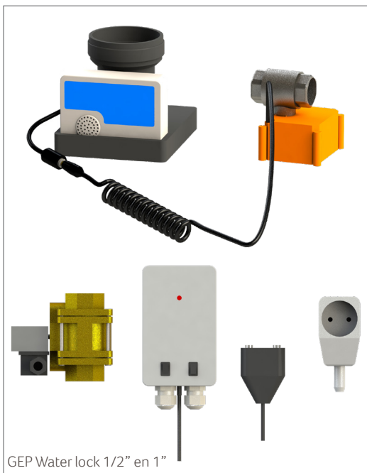
GEP Water lock 1/2" en 1"

Automatische afsluiting van waterleiding